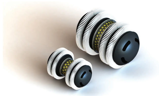
Figure 1 – Example Cokebusters' Smart Pigs

Unfortunately, it was not possible to obtain wall thickness measurements at these points. This is likely to be due to an irregular interior surface topology resulting in ultrasonic scatter or deflection at the areas of internal loss/corrosion. The increase in internal diameter was clearly visible in the graphical plots ( Figure 2 ) and 3D C-scans which accompany our report ( Figure 3 ).